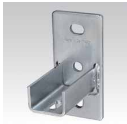
MPC-Saddle support, lengthwise