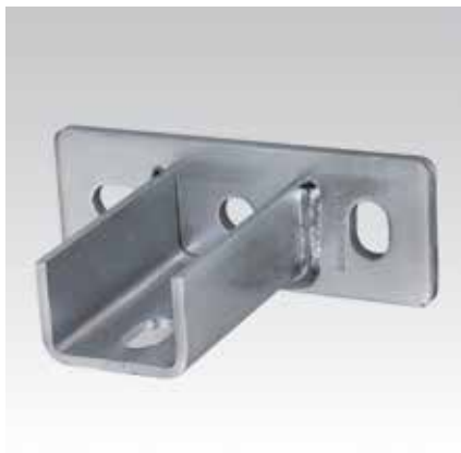
MPC-Saddle support, crosswise